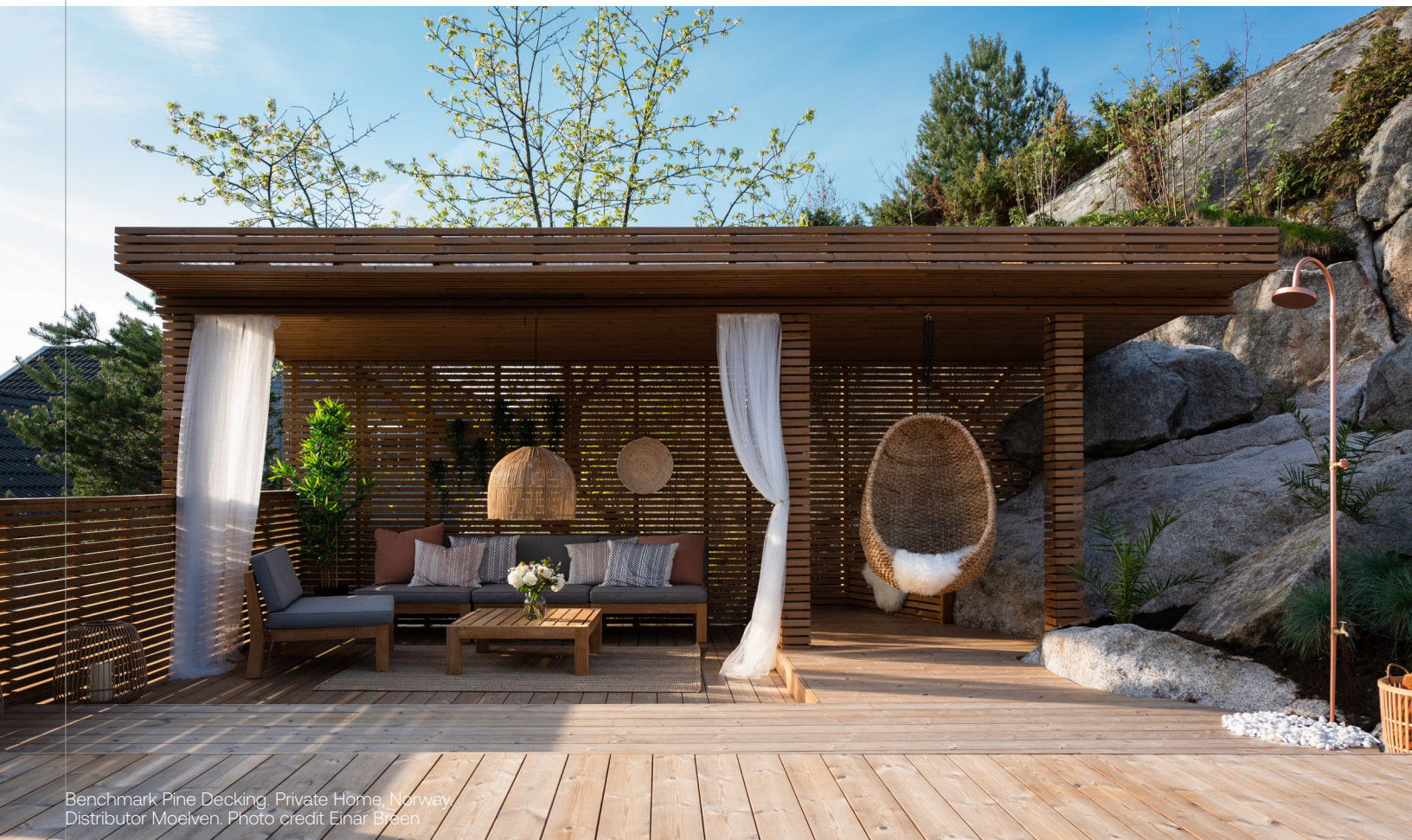
Benchmark Pine Decking, Private Home, Norway Distributor Moelven