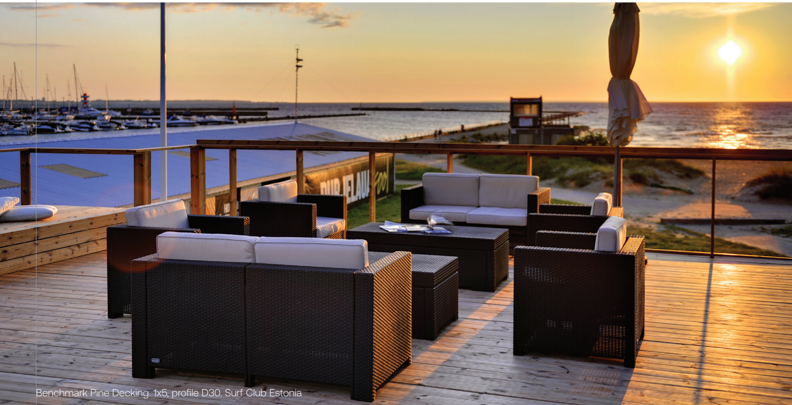
Benchmark Pine Decking, 1x5, profile D30. Surf Club Estonia