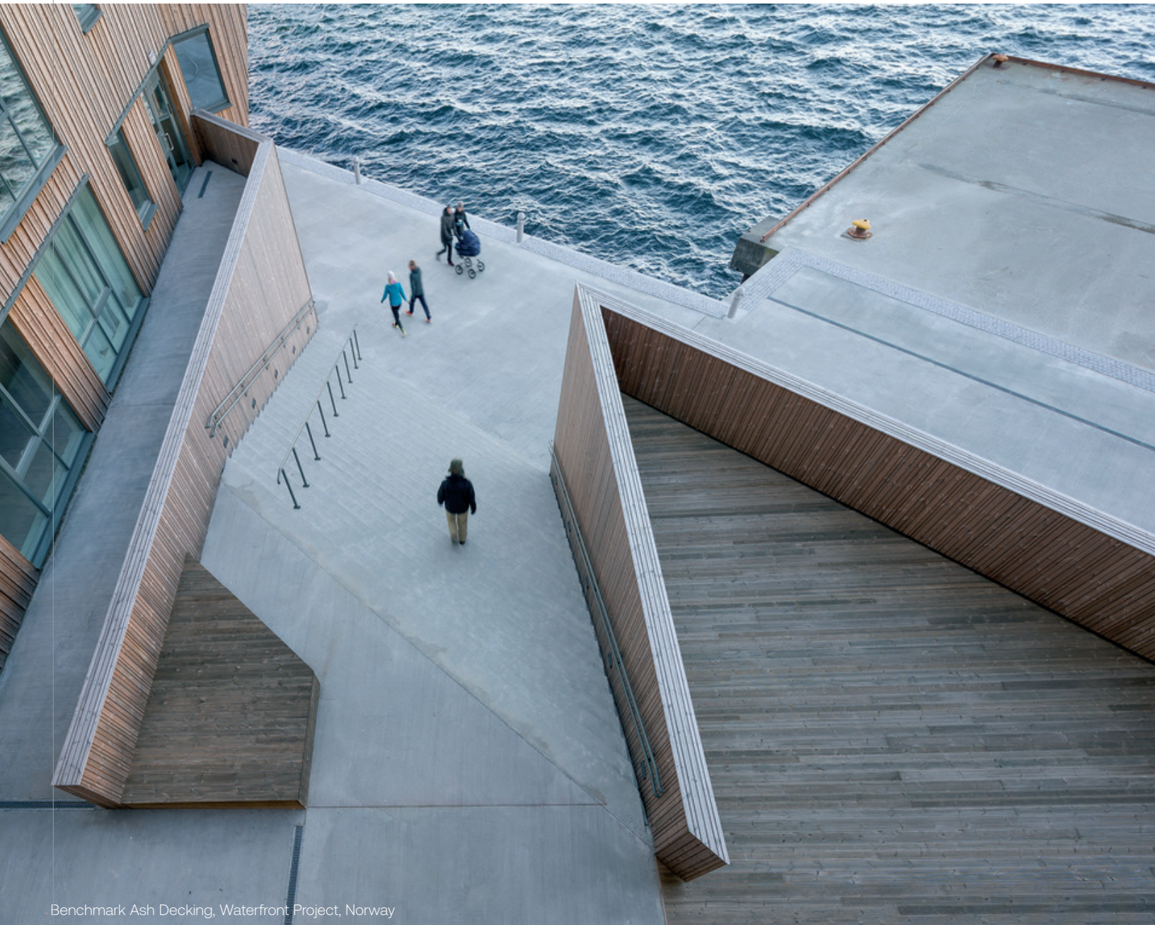
Benchmark Ash Decking, Waterfront Project, Norway