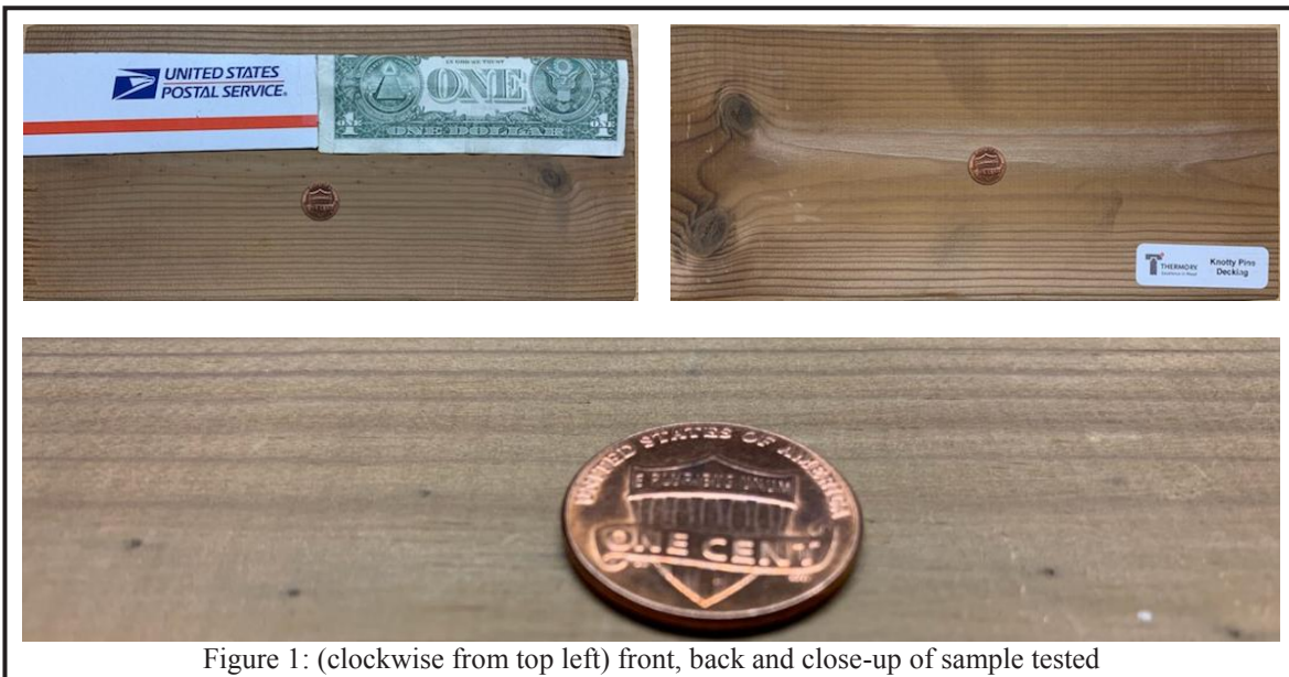
Figure 1: (clockwise from top left) front, back and close-up of sample tested

Figure 1 shows (one of) the sample(s). Red, green, blue, and white color references are included, with a U.S. penny (1/16 inch thick) for scale. The back of the tile is included to aid in positive identification.