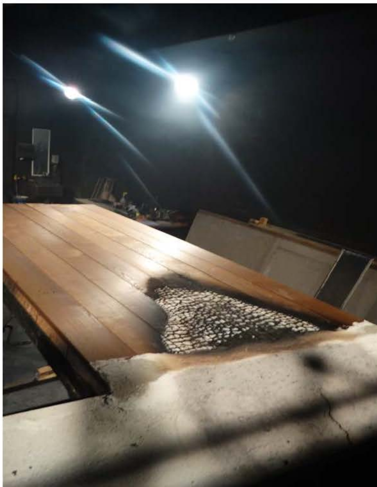
Photograph 2: First Spread of flame, post test.