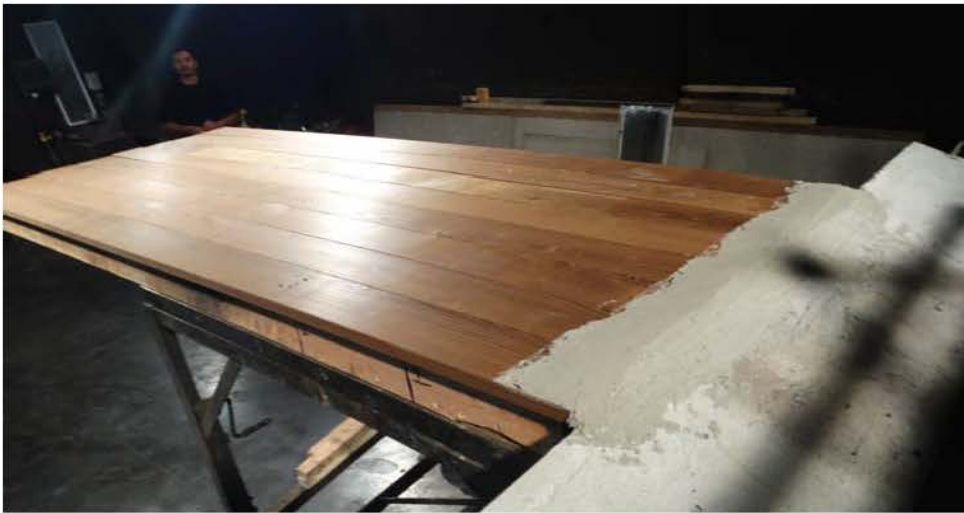
Photograph 1: First Spread of flame test Specimen prior to test.